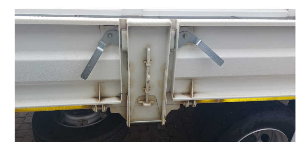
Image above: Ideal concept image of how drop sides and pillars should look.