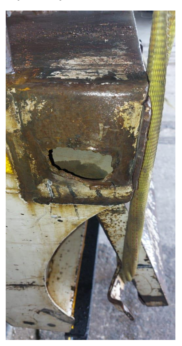
Images above: (left) Image used for illustration purpose to indicate how the end/rear pillar should be. Image on the right shows the current end/rear pillar on the left-hand side of vehicle that has been ripper off and needs to be replaced.